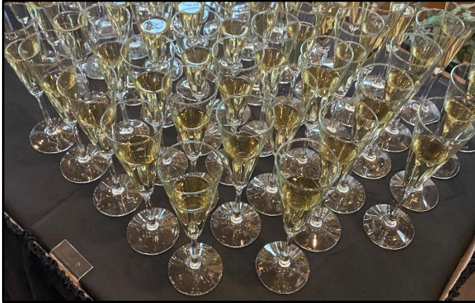
LaBoda Grading, Inc. $500 Sponsorship