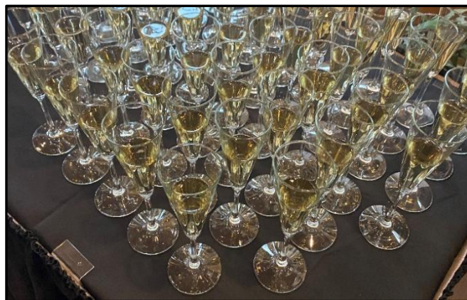
Donek Trucking $500 Sponsorship

Thank you so much! More sponsors are needed for the event, so if you know of a business or couples/individuals that may like to sponsor this fundraiser (there are varied sponsorship tiers), please call 218-663-0170 or see more information at: https://www.birchgroveschool.com/Gala-for-the-Grove Sponsorships come with event tickets that you can use or give away!