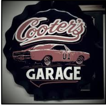
Cooter's Auto Repair $250 Sponsorship